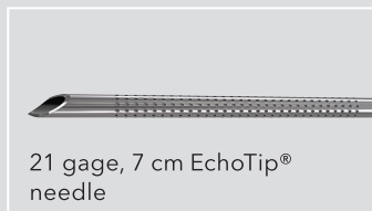
21 gage, 7 cm EchoTip® needle