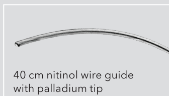
40 cm nitinol wire guide with palladium tip